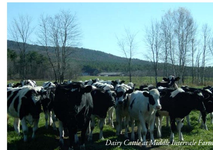
Dairy Cattle at Middle Intervale Farm