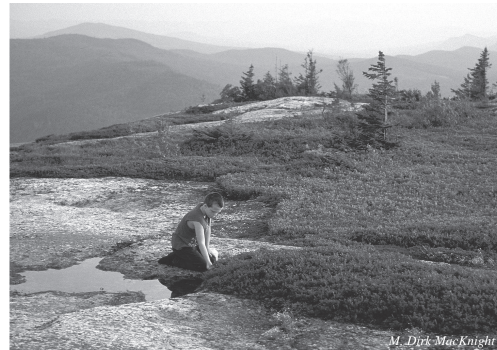
M. Dirk MacKnight

This is both a reminder and an announcement of some late news about our Annual Appeal. To help boost us over the top, a generous supporter of MLT has recently offered an incentive for members and friends to increase their contributions over last year. For the remainder of this year, such increases will be matched one-to-one, up to a total of $2,500. Thus, each $100 of increase generates an additional $100. As our Appeal letter stressed, increased contributions are a key factor in allowing MLT to continue successfully in protecting our area's natural assets. Let's rise to the challenge.