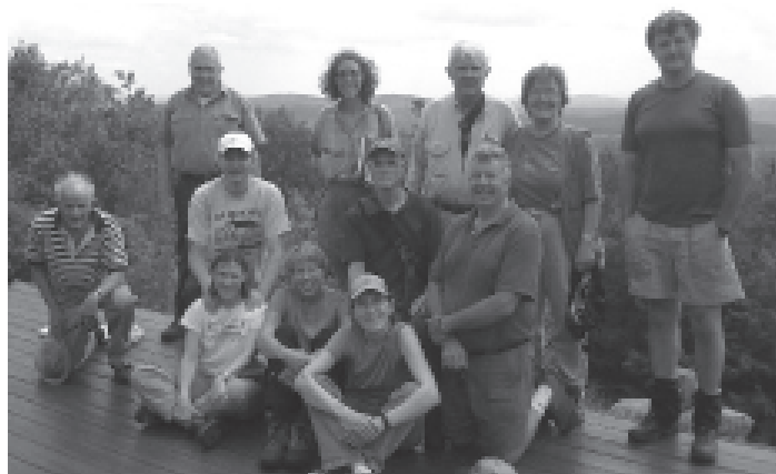
Northern Retreat Hike, July 2009