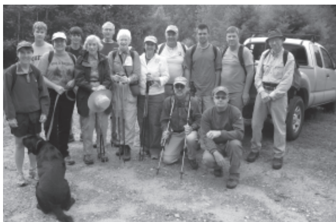
Whitecap Hike celebrating the 20 th Anniversary of the Mahoosuc Land Trust