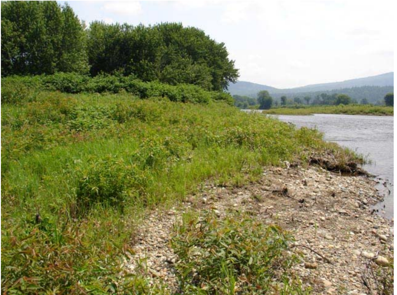
gravel bar on upstream end of island looking east

The island's upstream end is a low gravel bar. Midway, the island's south side is steeply cut by the river, and at the island's downstream limit is a steep, narrow channel (5-10 meters) that separates this island from the next.