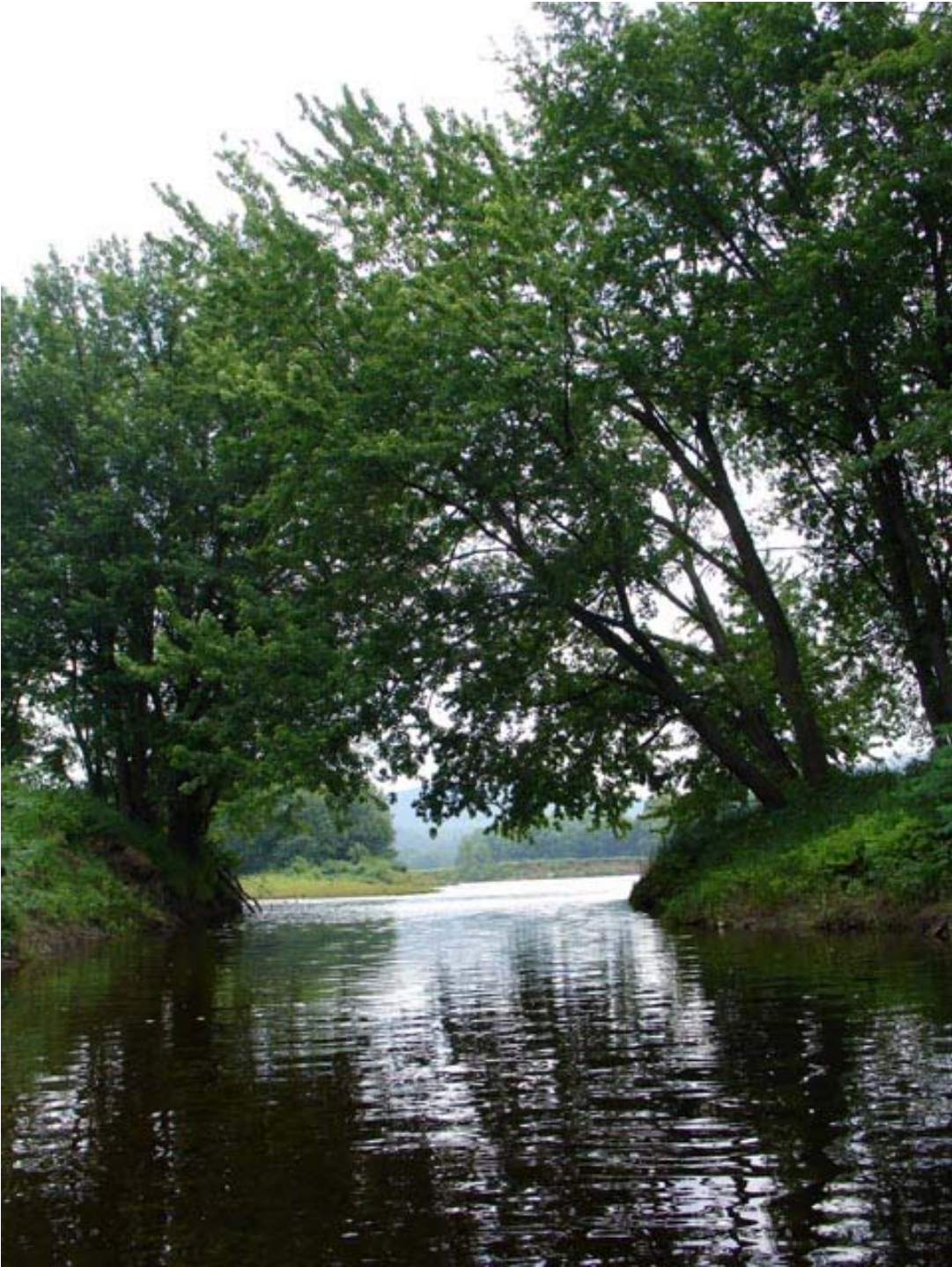
Channel at downstream end of island (looking south)