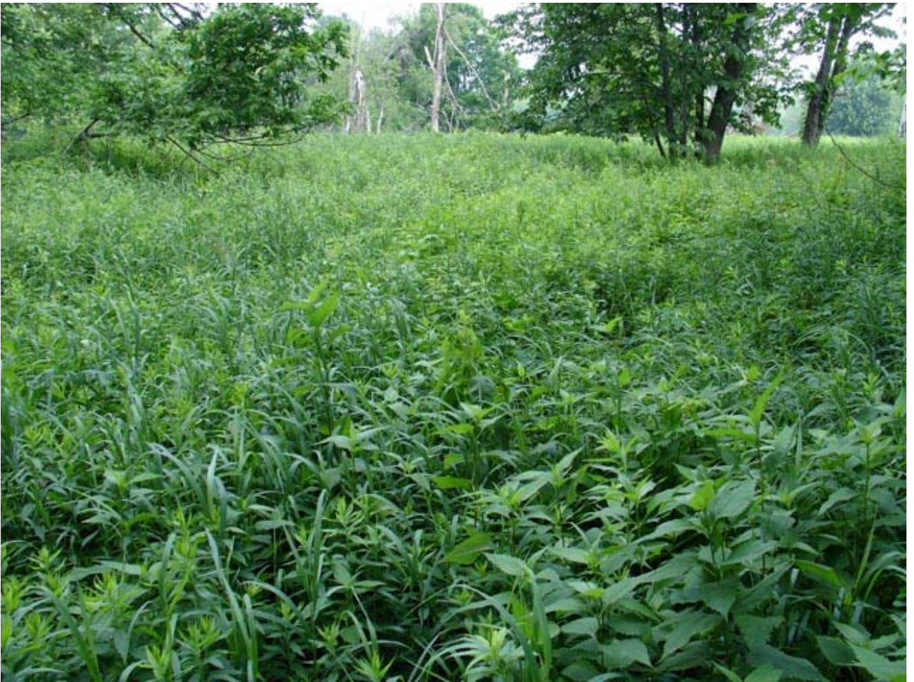
Lush cover, including Virginia creeper and redtop, under a sparse canopy of mostly silver maple.

A preliminary list of vegetation appears below. Silver maple is the dominant tree species. In the herbaceous layer, poison ivy is present, but not abundant, on the south side of the island where we landed. The island has a number of non-native plants including the invasives purple loosestrife, Japanese knotweed and reed canary grass. Ostrich fern is abundant above the back channel.