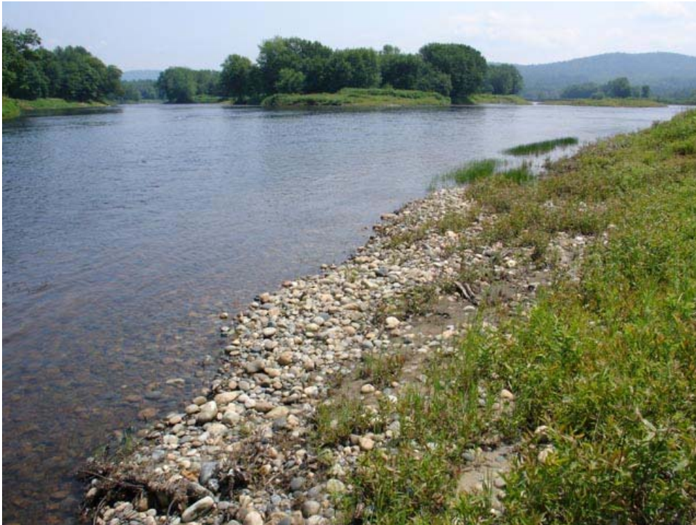
Head of unnamed Willis island as seen from upstream (west)